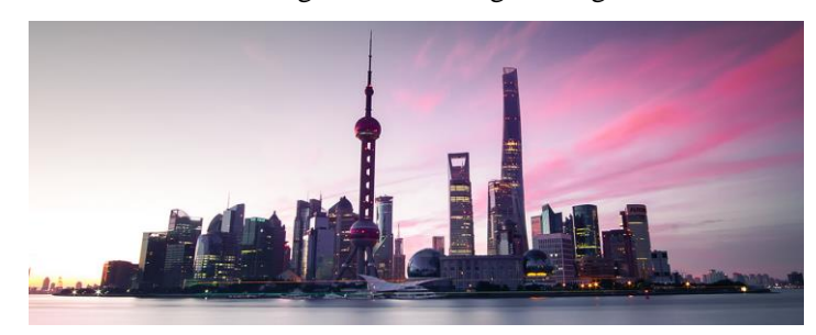
The Bund of Shanghai

Provide a showcase of recent developments and advances and offer an international forum to discuss and explore the future directions for geotechnical engineering.