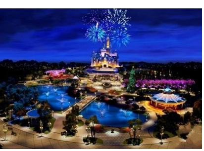
The Disneyland in Shanghai