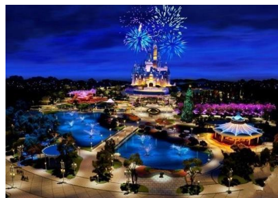
The Disneyland in Shanghai

GeoShanghai International Conference 2018