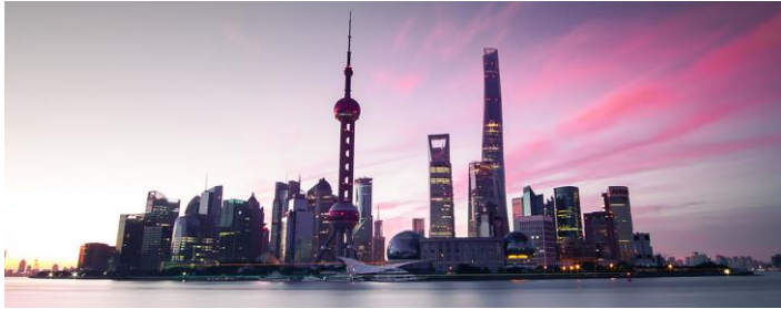
The Bund of Shanghai

Provide a showcase of recent developments and advances and offer an international forum to discuss and explore the future directions for geotechnical engineering.